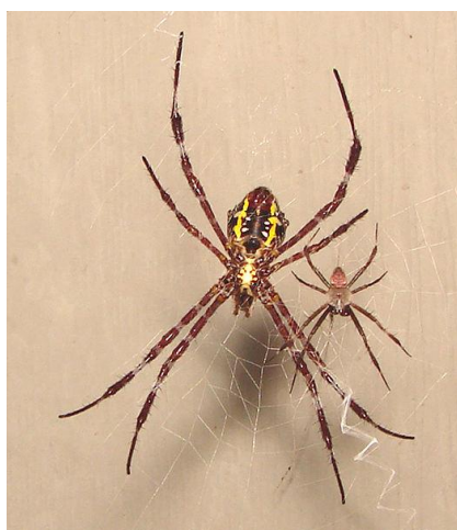
Larger female with smaller male

Argiopes are preyed on by birds, some wasps (especially mud daubers), lizards and other spider-eaters.